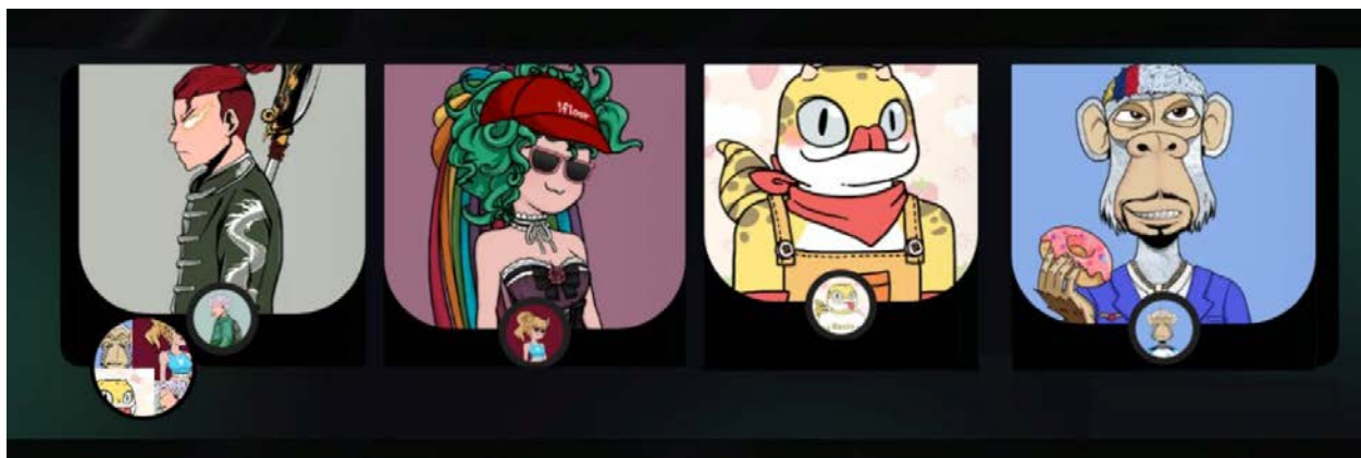
Fig 2 NFT COLLECTION OF 9NFTMANIA

Overall, 9NFTMANIA is building an NFT-powered infrastructure that contributes to the evolution of the metaverse, driving creativity, commerce, and a sense of community in virtual spaces.