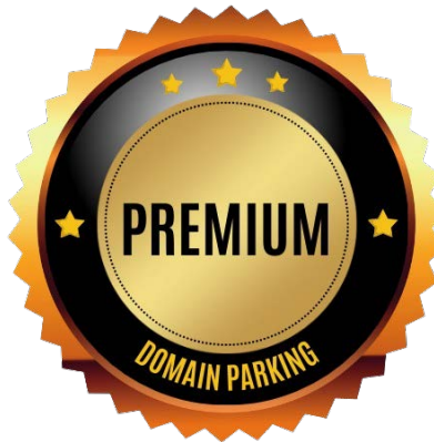
Fig 3 Premium Domain

In summary, the narrative of premium domains underscores their importance as highly valuable digital assets that contribute to brand identity, online authority, and strategic growth. These domains are seen as essential for businesses and individuals looking to solidify their presence in the rapidly evolving digital economy.