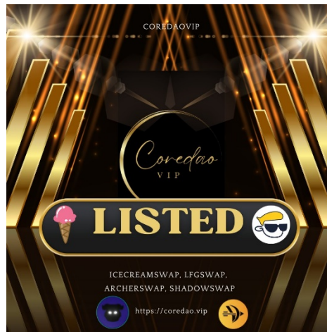
Fig 4 CoreDaoVip listing of 4 DEX